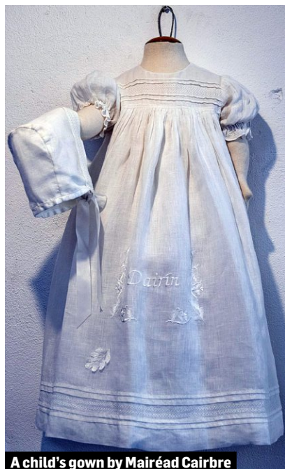
A child's gown by Mairéad Cairbre