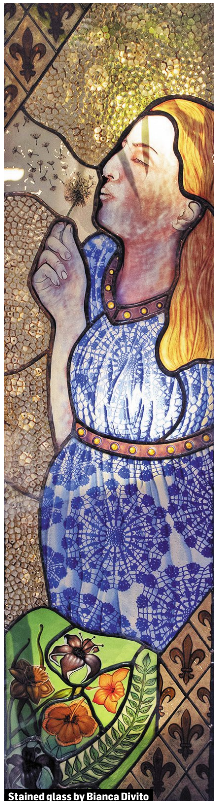
Stained glass by Bianca Divito