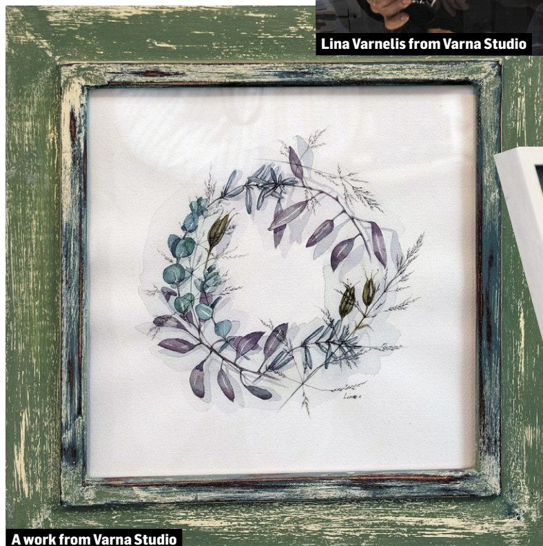
A work from Varna Studio