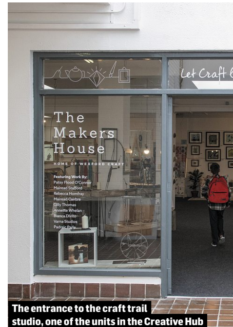
The entrance to the craft trail studio, one of the units in the Creative Hub

for an additional 10 to 15 young people.